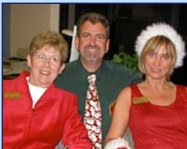
December Social hosted by Exchange Bank & Molsberry Markets, Inc. page 2