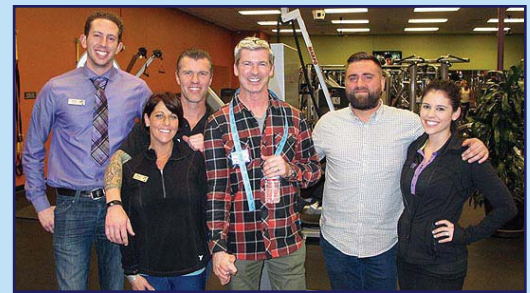
Our hosts at Anytime Fitness. The team consists of experienced and professional trainers and fitness experts. They offer introductory packages, weight training, low impact workouts, treadmills, aerobics, and dozens of fitness machines to suit anyone's needs. And members get full 24-hour access!