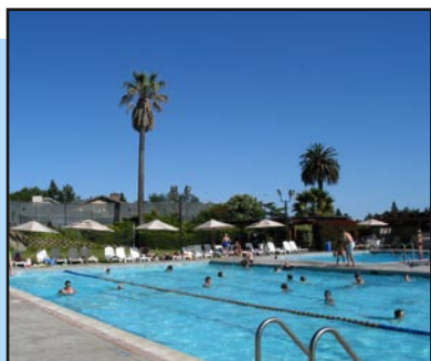
June Social & Fundraiser Wikip Tennis & Swim Center more on page 3