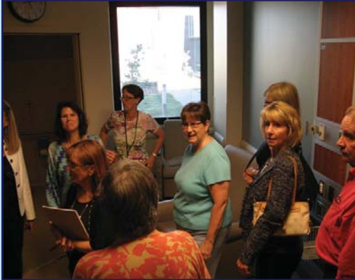
Patient rooms are spacious and efficient, and each has its own sleeper chair for family members who want to stay the night.

On Wednesday afternoon July 23, Sutter Medical gave the Mark West Area, Windsor, and Healdsburg Chambers of Commerce a tour of its new facility on Mark West Springs Road near Highway 101. The new hospital, under construction since 2010, will open October 25 of this year and features state-of-the-art design and equipment throughout.