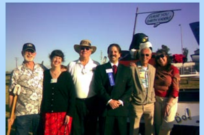
Chamber Members at PCAM