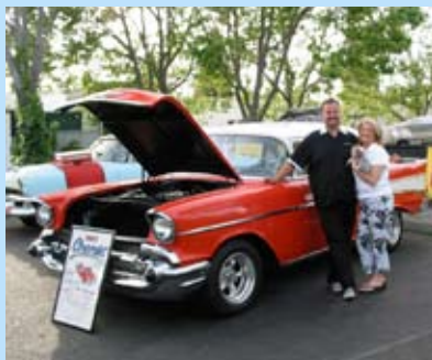
Social hosted by AutoBahn - page 2 & 3