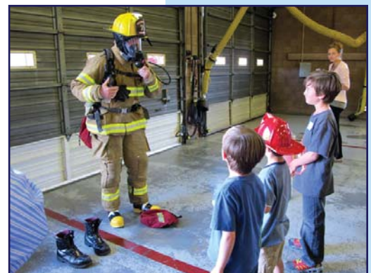
One of the fire fighters donned full fire gear (on that rather warm evening!) to show a rapt audience how it is done. We guess there was at least one future fire fighter in the crowd!