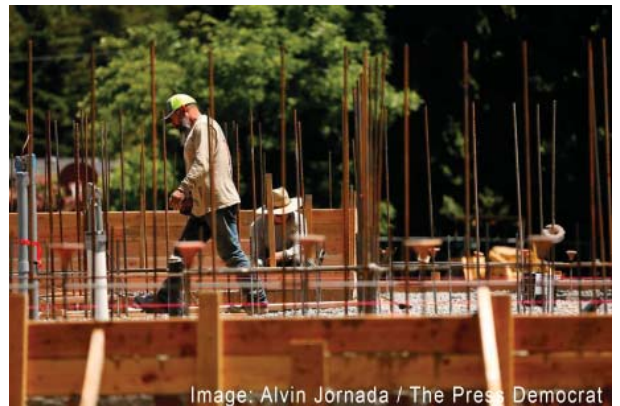
Construction in progress at Autocamp, a luxury camping facility near Guerneville

http://www.pressdemocrat.com/entertainment/5627687-181/selena-gomezs-netflix-series-thirteen