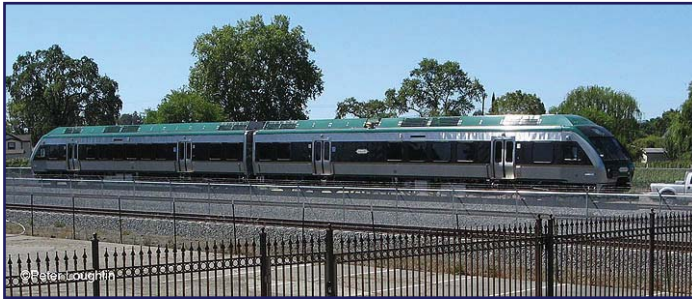
The SMART Train in its pen at Fulton, just off River Road.

Regarding pensions, Supervisor Gore is an advocate for the creation of a committee to review the numbers surrounding the pension issue. At this point, they are disputed. Who do you trust? As with any issue, we have to have facts that are verifiable and trustworthy in order to move ahead.