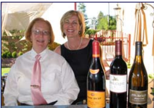
Social hosted by Vintners Inn page 3