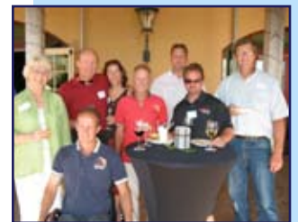
Pilots & guests from the Air Show