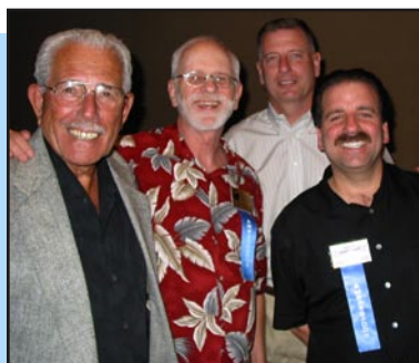
Chamber Installation Dinner more on page 3