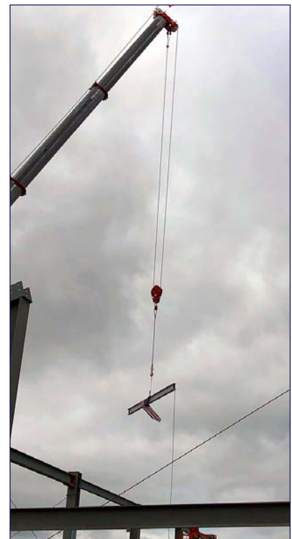
Precision Crane of Windsor lifts the last beam into place.

It will connect via a pathway to the current terminal that will still be used by American and United airlines, Stout said.