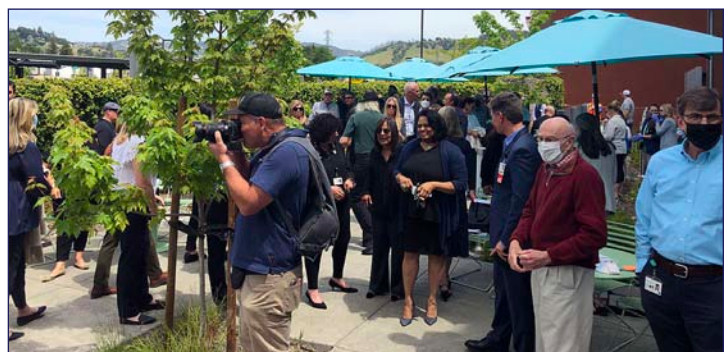
The large crowd at Sutter's Ribbon Cutting.

We have two other great Socials coming up. The first is on May 26th