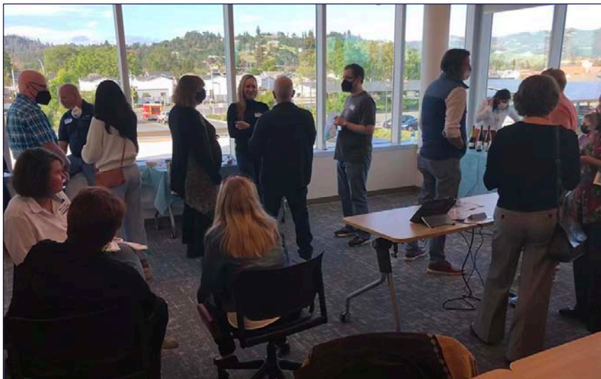
Members of the Mark West Area and the Windsor Chambers socialize just before touring Sutter Hospitals new addition.

As a major part of the communities of both Windsor and the Mark West Area, Sutter Santa Rosa Regional Hospital was delighted to be able to host the recent joint Social for both areas' chambers of commerce. The chambers were also thankful to Sutter for their being able to host them and provide attendees with a tour of the new wings. Two tours were provided so as to prevent overcrowding, with