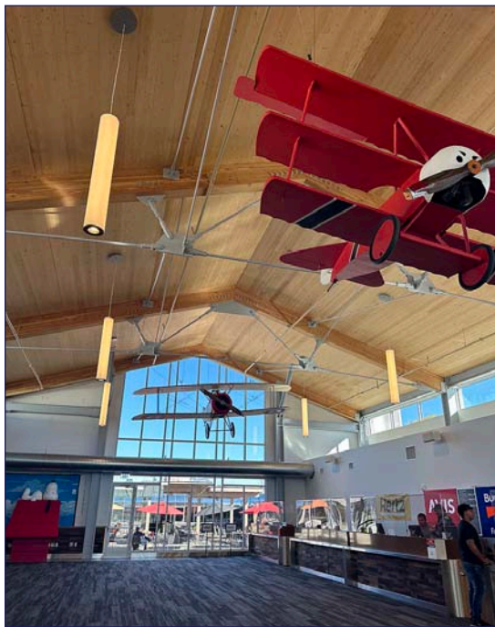
The new arrivals and baggage claim area at the Charles M. Schulz-Sonoma County Airport (STS). Overhead, that's the Red Baron being chased by Snoopy (who else?) in his trusty Sopwith Camel.

San Francisco airports. It will encourage visitors to come and enjoy our local restaurants, wineries, coastal areas and redwoods without delay—such a great boost to our local tourism economy."