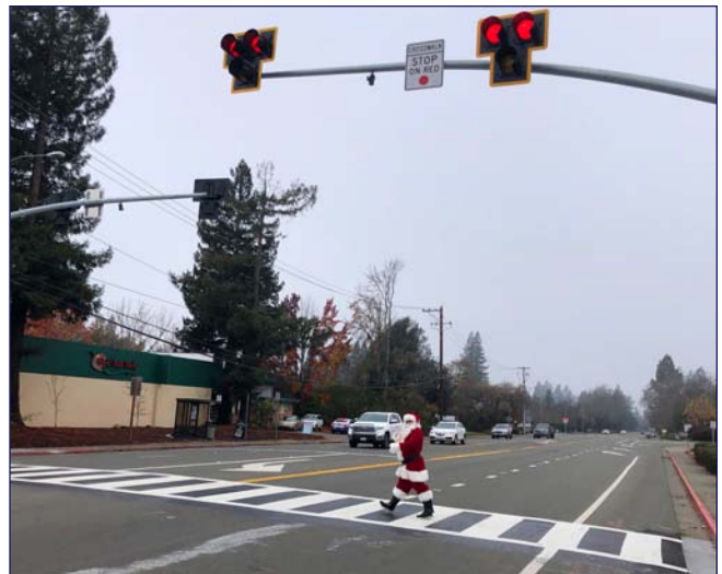
The new "HAWK Light" in Larkfield is much safer for Santa than climbing down chimneys.

The Sonoma County Department of Public Infrastructure announced the installation and operation of a new high-intensity activated crosswalk signal, or HAWK, at the intersection of Old Redwood Highway and Lark Center Drive in Larkfield. The new traffic control device, also known as a Pedestrian Hybrid Beacon, is designed to aid pedestrians by notifying them when to cross the street at a mid-block crosswalk. Unlike conventional traffic signals, the HAWK is only operational when activated by a pedestrian. Audible cues enable the visually impaired to locate the pushbutton to activate the signal.