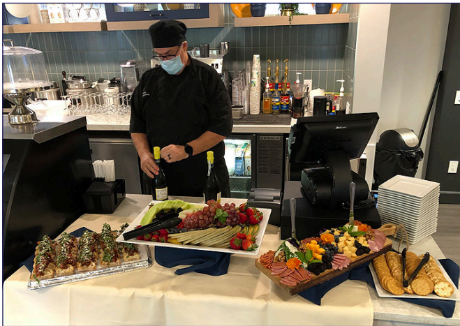
Arbol Residences of Santa Rosa: Senior Living provided Chamber members with a fantastic buffet.