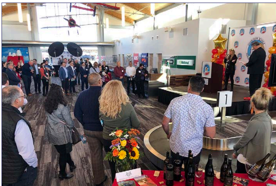
Charles M. Schulz-Sonoma County Airport VIP Terminal Grand Opening and Ribbon Cutting.

"Charles M. Schulz – Sonoma County Airport is the gateway to our world-class community. A modernized and efficient airport will support our economy and welcome travelers from around the world to Northern California," said Rep. Mike Thompson, D-St. Helena. "I was proud to help the airport receive $10 million in funding from the FAA Airport Improvement Project, and it is amazing to see the impact that this funding had on this facility. Congratulations to Sonoma County and the airport officials for the grand opening of the newly renovated and modernized terminal hub, and I look forward to seeing how STS will connect us to the world."