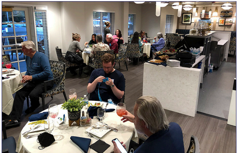
Chamber members relax and network at the October Social.