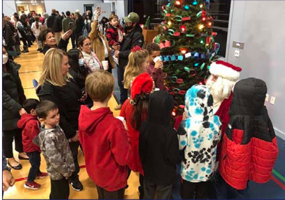
Santa continues to make glad the hearts of childhood.