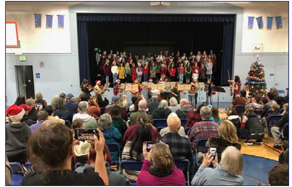
Music rings in the holiday season for the Mark West area.