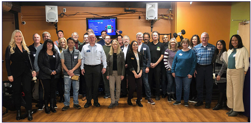
Anytime Fitness Larkfield was host to an enthusiastic crowd at the November Social.