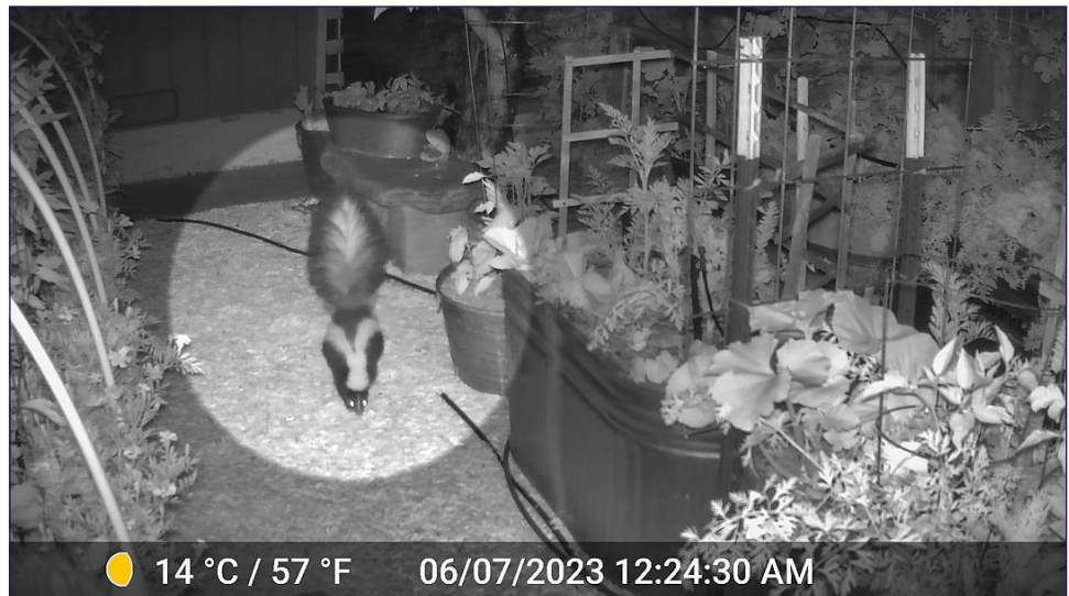
Night camera