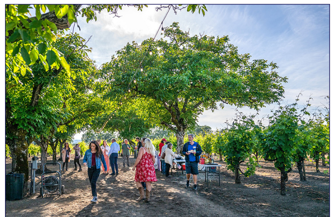
June Social attendees got to enjoy the beautiful vineyards and walnut orchard at Bisordi Ranch.

With the Pot of Gold drawing complete, only the Business Card drawings remained. The prizes and winners for this month were: