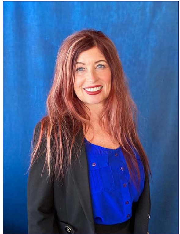
Tabatha Bonetti-Asker, Notary Maven.