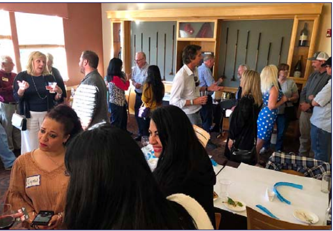
The large crowd enjoyed the food and wine provided by Charlie's Restaurant.