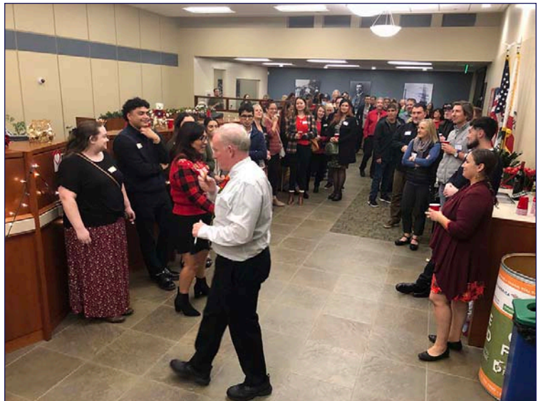
Above: Our December Social set another attendance record. The event was an amazing combination of good food and drink, business to business mixing and holiday cheer.