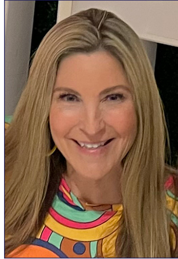
Becky Menzel.