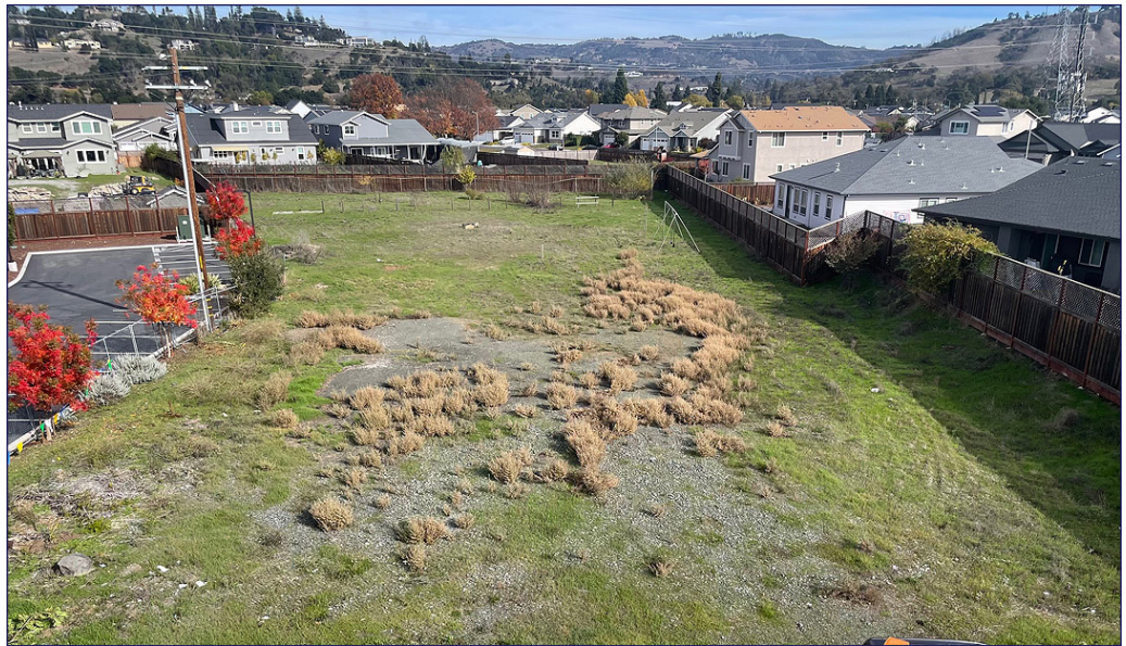
With the purchase complete, this empty lot is ready to become a valuable community asset.

The Fund will be seeking community and business volunteers to help with construction costs. Sponsorship opportunities are available to help construct park amenities, such as a gazebo, walking and fitness path, butterfly garden and more. The Saba Foundation has graciously donated funds for the children’s playground. Learn more at www.markwestarea.org . Volunteer opportunities are available and all help is welcome!