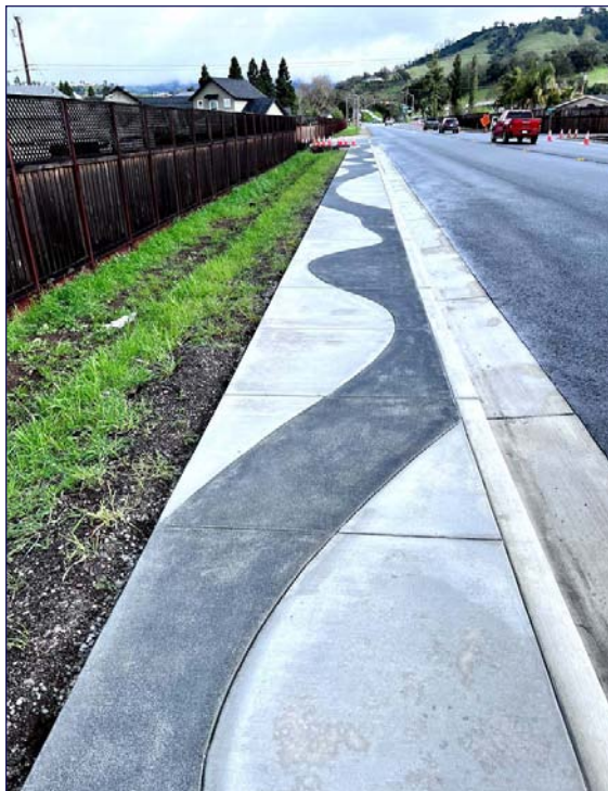
The new sidewalk, with its "sparkle grain" river.