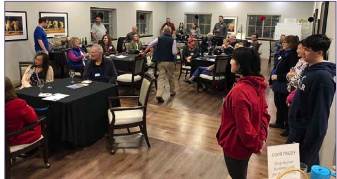
Great turnout for our January social hosted by The Lodge at Piner Road.