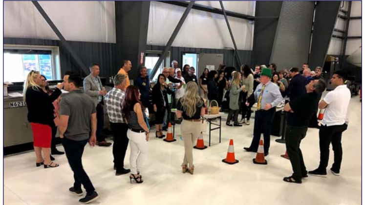
We had a big turnout of members and guests at our March Social.